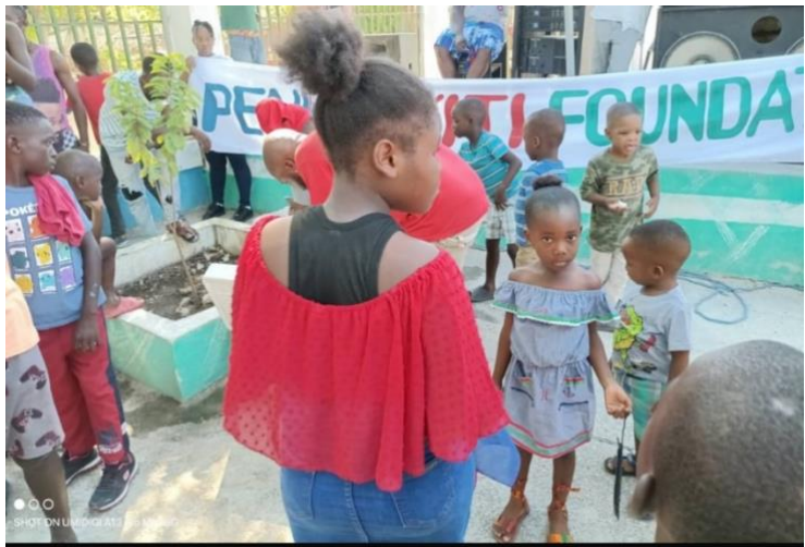
My wife, my daughter and my son take part in many events.

Awareness walk to encourage kids to go to School in Fond Parisien