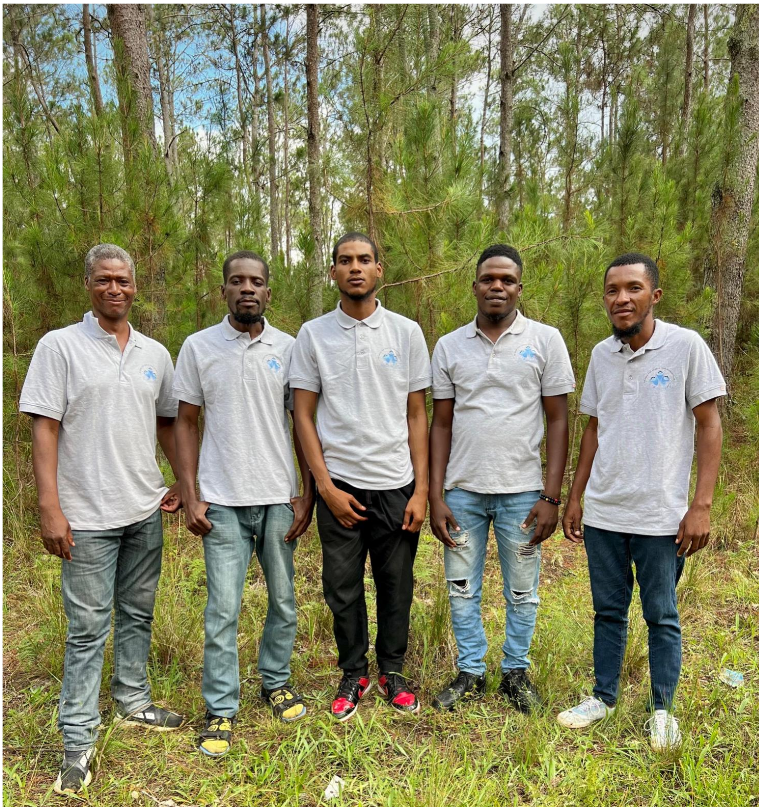
Our strong and beautiful staff in the field in Haiti